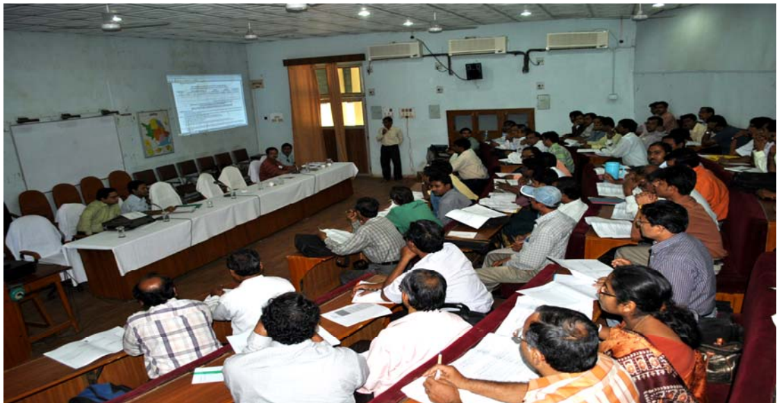
Training of OC Census Operations of 37 Census Charge of the District, 02.03.2010