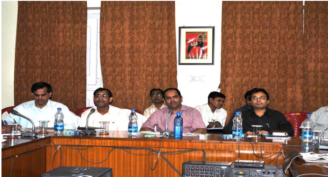
DM & Principal Census Officer imparting Training to BDOs & SDOs, 27.02.2010